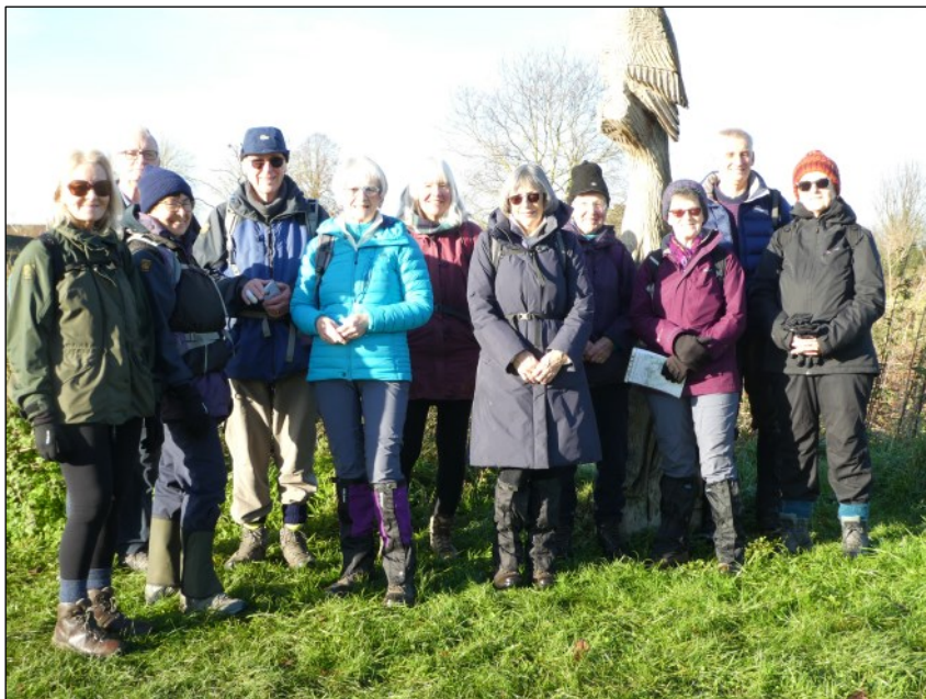
The midweek walkers pictured on their walk from Henlow, which was followed by an excellent lunch at The Crown